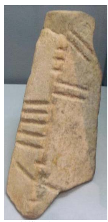
Brookhill Ogham Fragment County Kerry, Ireland Reads: MAQ LUG